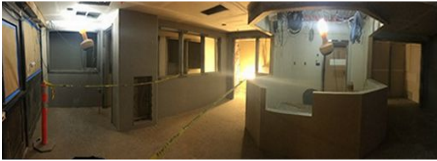
Work underway in the Lobby

on this floor will now see it's demise as there is a minimal crew from CANPRO working through the week between Christmas & New Years. Along with this demolition will come the closing of the individual washroom on the east side of the 2 nd floor that was being used as the men's staff washroom. The temporary men's staff washroom will now be located on the second floor south right beside the service elevator. The washroom signage has been changed to reflect this.